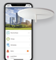
Optional Facilities Software