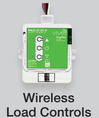
Wireless Load Controls

Wireless lighting control systems can enhance the customer experience in the facility and support ease of use by the employees. And with automation and control, a system can help maintain a level of safety and security to the space.