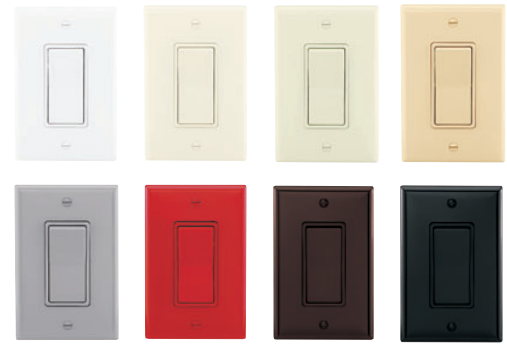
Cooper's Commercial Specification Grade Decorator Switches – Select from the industry's widest range of color and feature options.